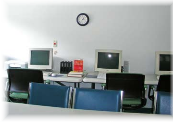
The in-house computer lab and library offers access to computers, the internet, and a variety of books and movies.

Features such as large windows and kitchen-to-living room wall openings, make for bright, sunny rooms with an overall open-concept feel.